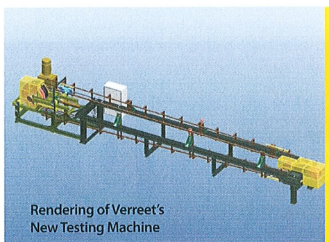
Rendering of Verreet's New Testing Machine

The first prototype of Verreet’s alternative machine was built in 2008. It did some of its first testing trials for NASA. The fatigue machines are presently on the